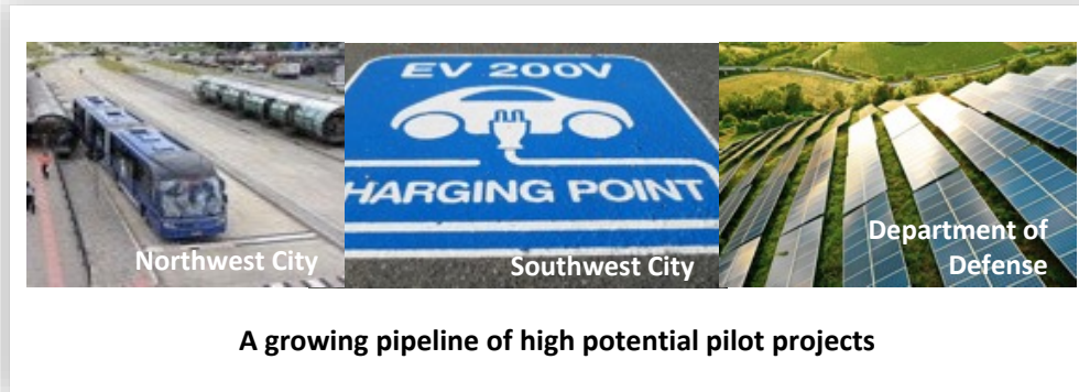
A growing pipeline of high potential pilot projects

Through creative financial structuring, holistic planning, and phased integration of infrastructure components, TESIAC creates value and brings advantages to the multiple stakeholders including access to capital, payment certainty, resilience, reliability, and consumer convenience, delivering Smart Cities with an ROI.