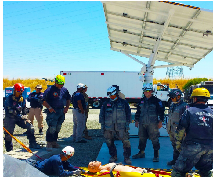
* EV ARC™ solar powered charging stations are included in the FEMA Authorized Equipment List, under designation 10BC 00 SOLR Chargers.

No fueling. No emissions. No noise. No on-site liquid fuel storage or handling.