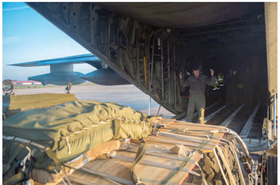
Our intent is to provide support to sustain our forces.

Significant change to the logistics enterprise must begin immediately to support this reorientation and continuously ensure the lethality of the MAGTF. This headquarters is already busy innovating and developing new ways to modernize a rapidly aging logistics enterprise, using guidance such as the hybrid logistics vision and the still developing expeditionary advance based operations (EABO) concept as points of reference. The Next Generation Logistics (NexLog) team continues to